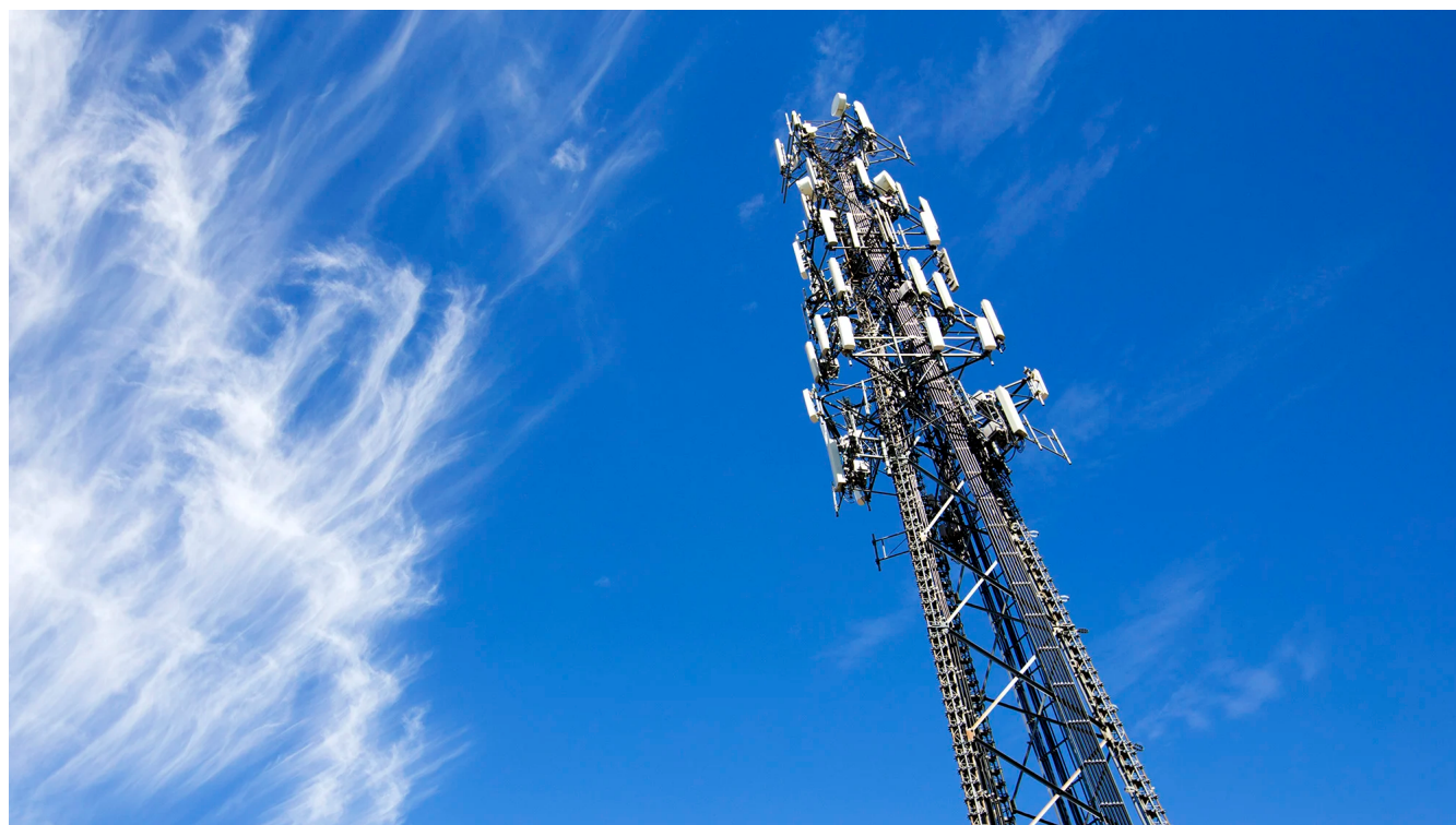
A traditional cell phone tower.

🕒 2 minute read · Updated 8:11 AM EST, Thu February 22, 2024