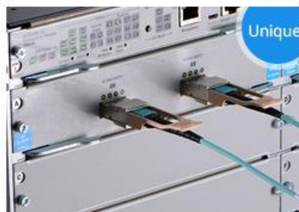
HP 5406R ZL2 V3(J9996A)