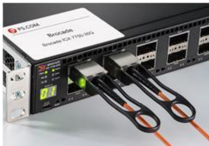
Brocade ICX 7750-26Q