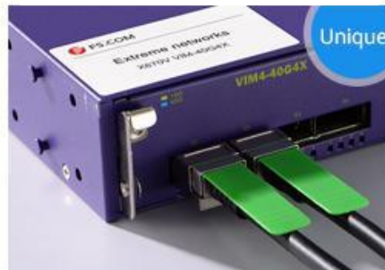
Extreme Networks X670V VIM-40G4X