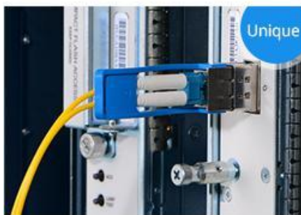
Cisco ASR 9000 Series(A9K-MPA-1X40GE)

The original switches could be found nowhere but at FS.COM test center, eg: Juniper MX960 & EX 4300 series, Cisco Nexus 9396PX & Cisco ASR 9000 Series, HP 5900 Series & HP 5406R ZL2 V3(J9996A), Arista 7050S-64, Brocade ICX7750-26Q & ICX6610-48, Avaya VSP 7000 MDA 2, etc.